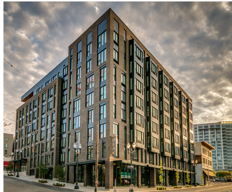
Alta Peak Apartments