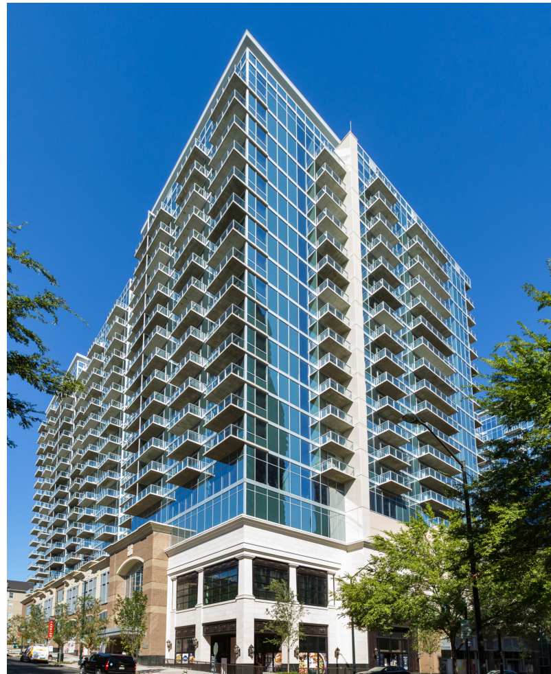
Sixty 11th, Atlanta, Georgia

Risk management is ingrained in MIM's culture and integrated throughout the organization. When assessing credit risk related to investment opportunities, we conduct bottom-up, fundamental research and focus on multiple factors. Financially material ESG considerations are an important part of our due diligence, as we seek to identify issues that may impact the reputation of a borrower as well as its financial condition, credit rating and transaction pricing. ESG considerations and related impacts are also an important part of due diligence for real estate equity acquisitions. We believe that adhering to sound ESG practices can help minimize financial risks such as controversy, triggered loss of customers, fines, penalties and environmental cleanup costs.